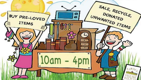
TABLE TOP SALE all around the village... SATURDAY 21 MAY

Don't miss out on this wonderful exhibition!