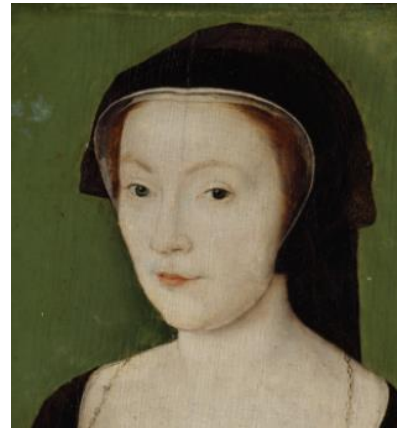
Mary of Guise