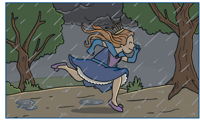
The quick queen runs in the sun. The quick queen runs at night in the rain.