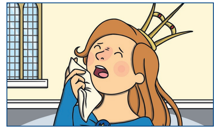
The queen says "achoo, achoo!" Be quiet, queen! The poor queen is sick.