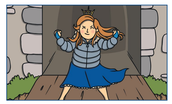
But the queen will not quit! The queen will not be quiet! The queen gets up. Quick, bring her a coat!