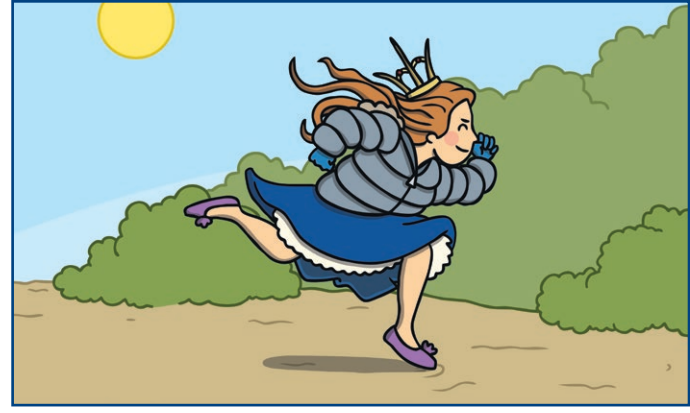
The queen's coat helps to keep her well. The queen keeps on being quick!