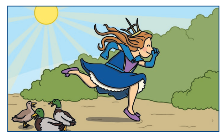
The queen runs fast. The queen is quick! "Quack, quack!" go the ducks as the quick queen runs.